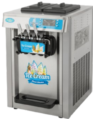
TABLE TOP SOFT ICE CREAM MACHINE

Description: Table Top Stainless Steel 3