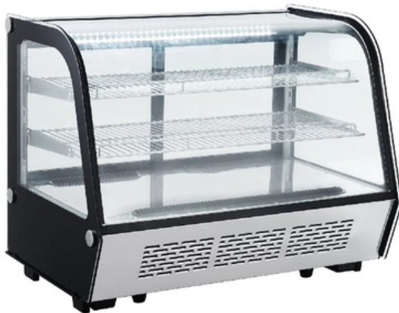
TABLE TOP HEATED DISPLAY UNIT