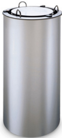
PLATE WARMER DROP IN PLATE DISPENSER