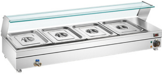
TABLE TOP BAIN MARIE